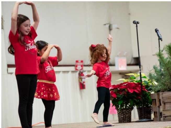
Dancers from Diamond Dance Co. perform an encore of their Christmas recital during Pioneer's Member Appreciation event.